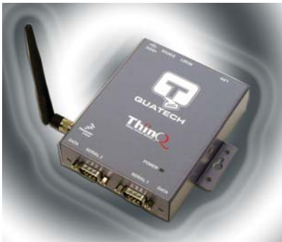
Quatech wireless device servers are the fastest and easiest way to connect a standard serial device to an 802.11b wireless network.

When looking for the ultimate in wireless device server ease of use and performance, look no further than the new Wireless Series models from Quatech.